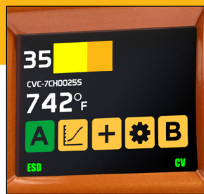
Tip temperature displayed on large color screen.